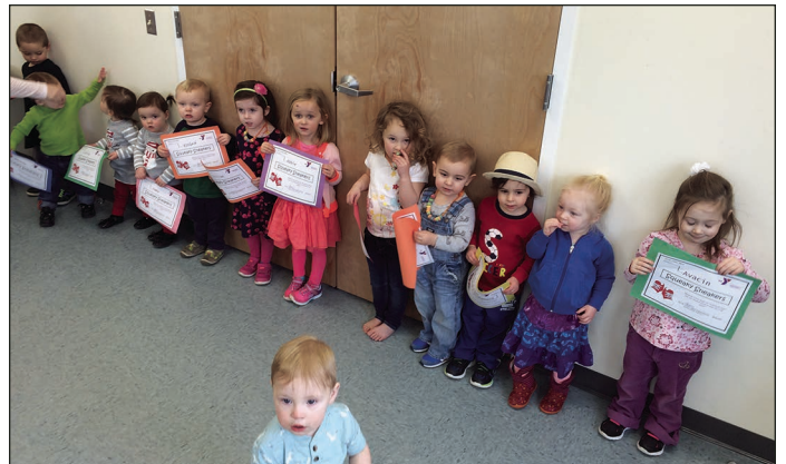
Fall and spring programs for young children include Squeaky Sneakers (above) and Short Sports (below).