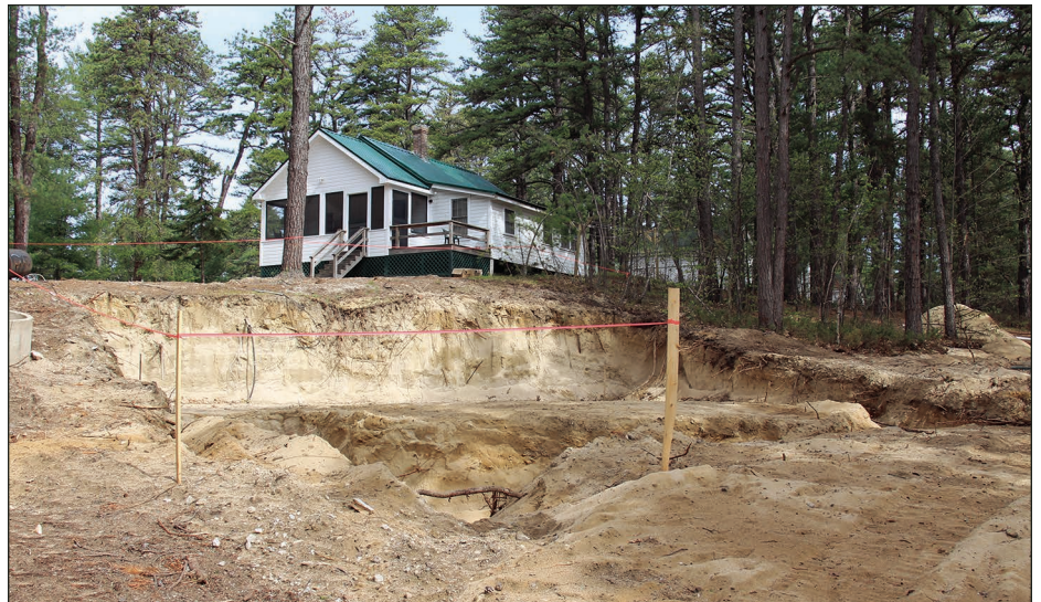
Foundation work at the site of the future "Palace"

Over the past year a committee worked with the Portland architecture firm SMRT, Inc. to design a new year round residence for the Director. This house will be a fully functional home for a family to live in. The ground level will also serve as a meeting space for staff training or events. Many familiar features from the old house will resurface, such as the porch overlooking the waterfront and the classic white and green color scheme.