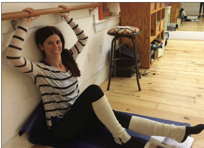
The Barre Class is offered in both spring and fall.