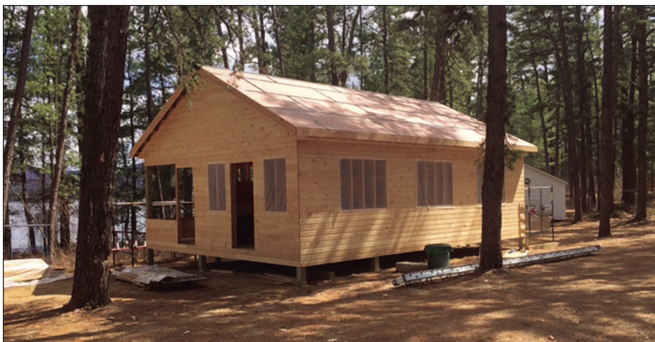
New Big A