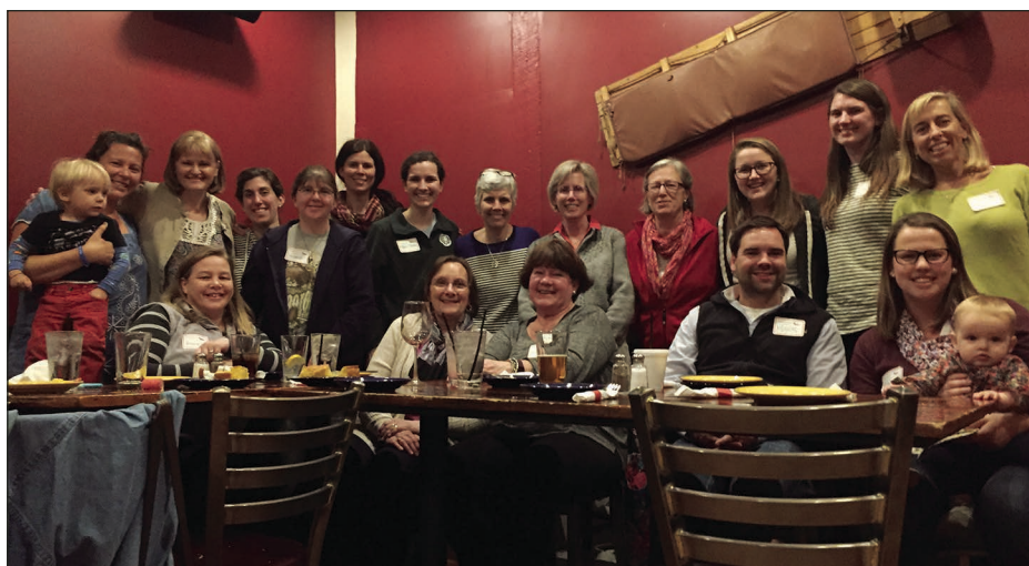
Alums gather at The Farm in Manchester, NH.