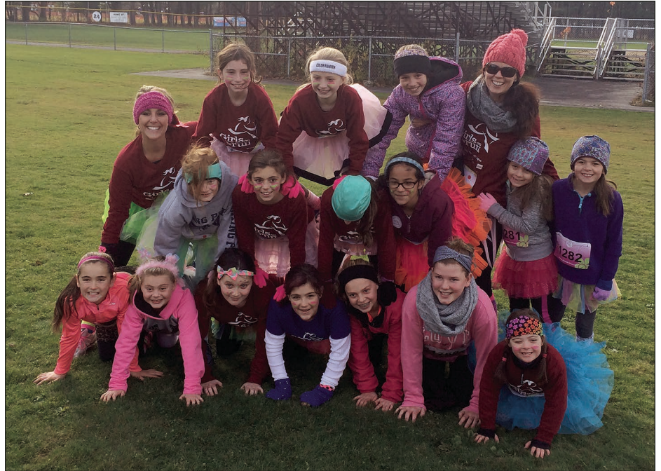
These Girls on the Run had a blast strengthening their spirits, minds and bodies.

Girls on the Run encourages positive emotional, social, mental and physical development. Participants explore and discuss their own beliefs around experiences and challenges girls face at this age. Designed to allow every girl to recognize her inner strength, the Girls on the Run curriculum inspires girls to define their