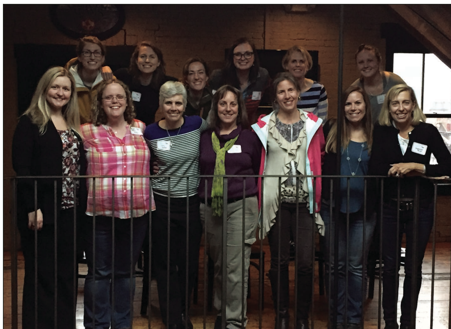
On May 4th, alumni gathered at Rivalries in Portland for a reunion.