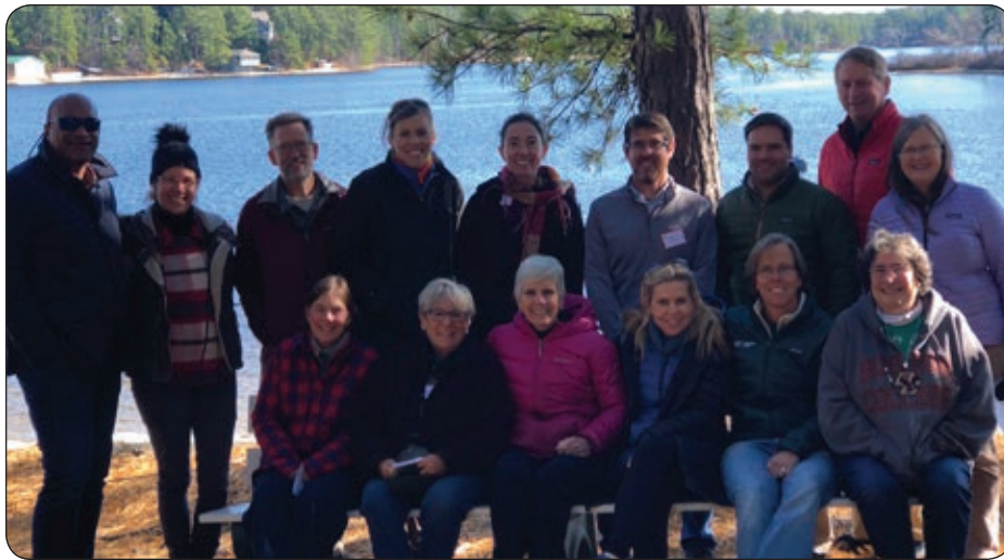
The Camp Huckins Board of Directors gathered at camp for a Board meeting last fall.