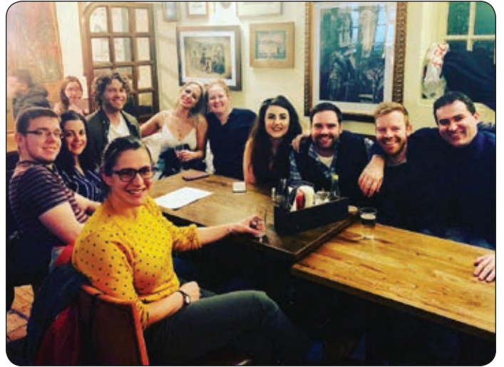
London Alumni reunion on February 20, 2020.