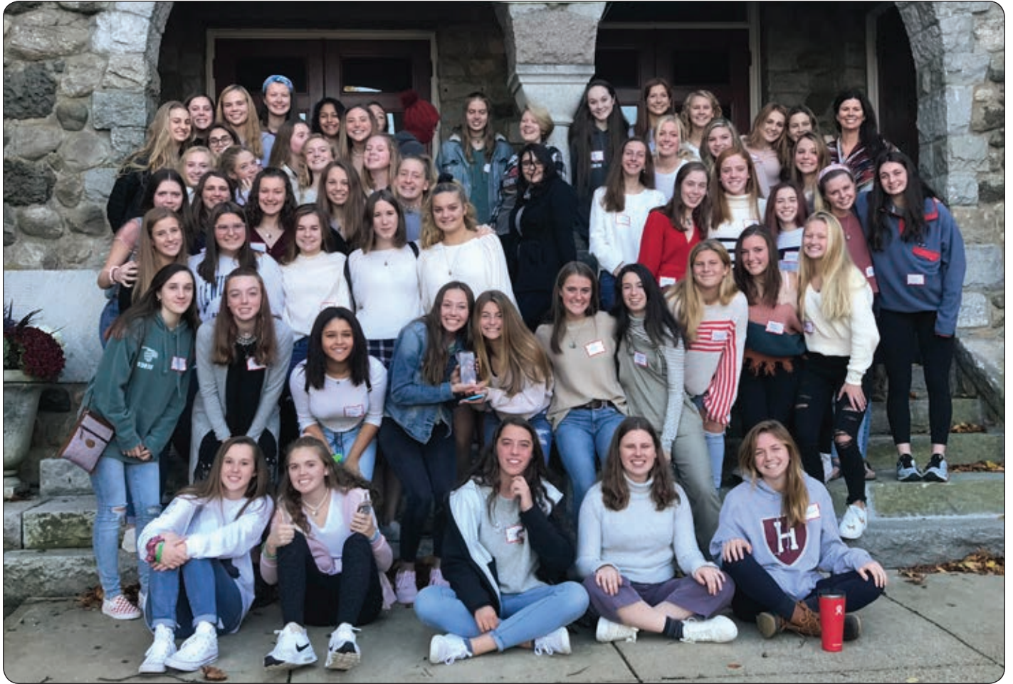
The Leadership Division Reunion was held on November 2, 2019 in Lexington, MA, for girls in our 9th and 10th grade program in 2019.