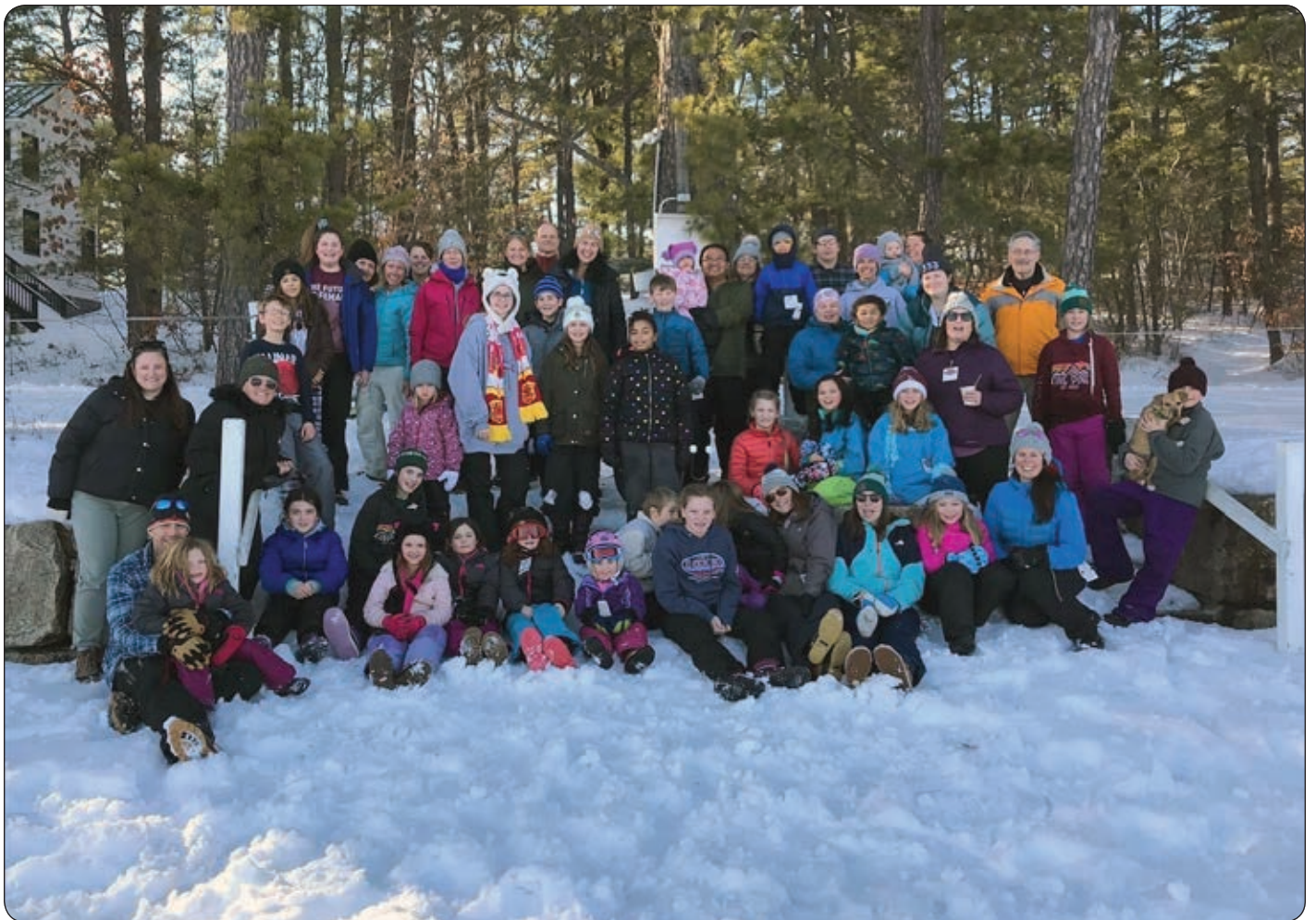
On February 22, 2020, camp hosted their annual "Snow Day" at camp. It was a gorgeous day filled with lots of sledding, hot chocolate, s'more eating and good conversation.