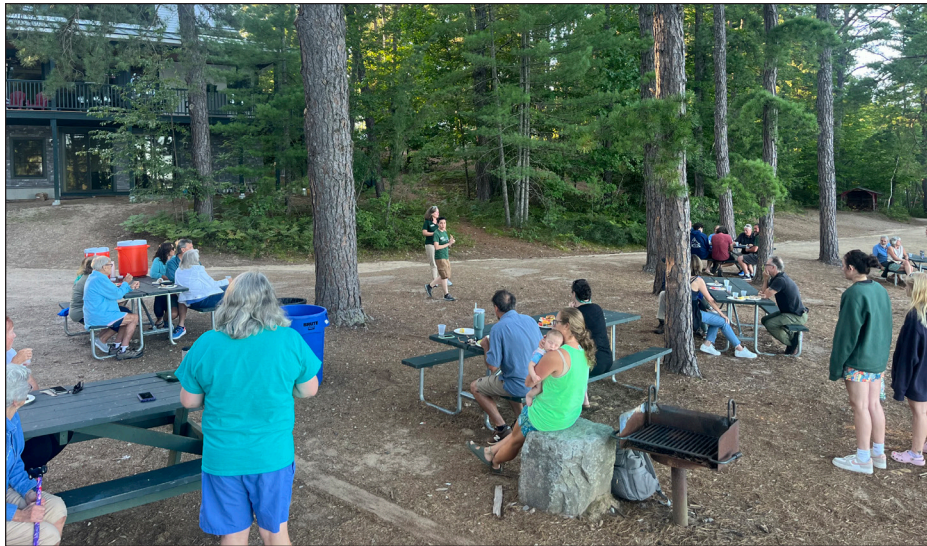
The inaugural Huckins Summer Social.

On a picture-perfect late August evening, community members gathered on the shores of Lake Ossipee for our inaugural Huckins Summer Social event. Huckins neighbors, vendors and community friends were invited to a cookout at the waterfront, tours of the facility and to hear camp updates from the past season. We are so thankful for all the support and care our community shows us, and it was so much fun to close out the summer season with them.