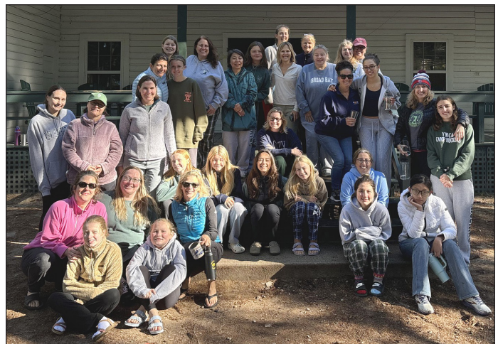
Mother/Daughter Weekend Leadership