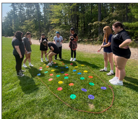
Middle school students focusing on team building.