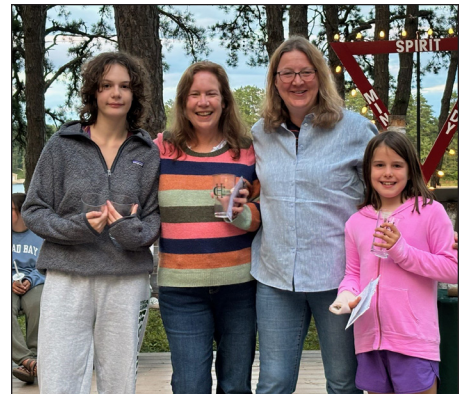
Family Camp Double Hucksters