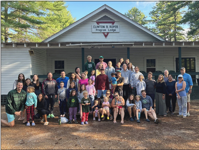
Labor Day Family Camp Juniors

Labor Day Family Campers truly made every moment count! We can't wait to celebrate the holiday weekend with all of you again from August 29th to September 1st.