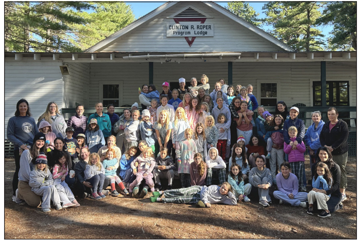
Mother/Daughter Weekend Middlers