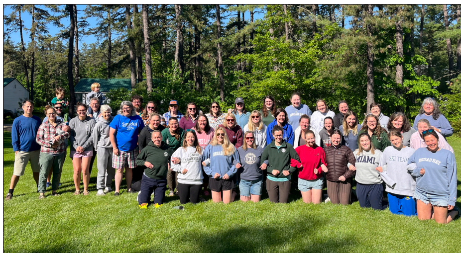
Spring Alumni Work Weekend Volunteers

Our fall weekend also saw the Nellie spirit in full force as our volunteers braved the chilly lake to remove the waterfront floats, take the last of the boats up to their winter home of the