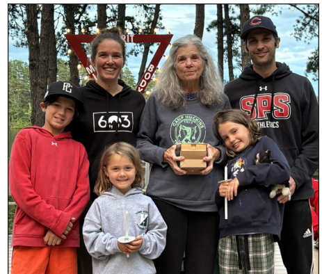
Family Camp 35-Year Hucksters