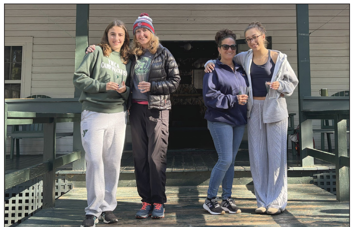
Mother/Daughter Double Hucksters