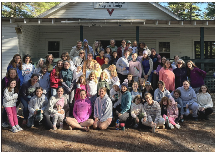
Mother/Daughter Weekend Seniors