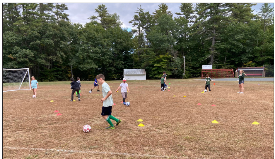
Freedom Soccer team practicing.