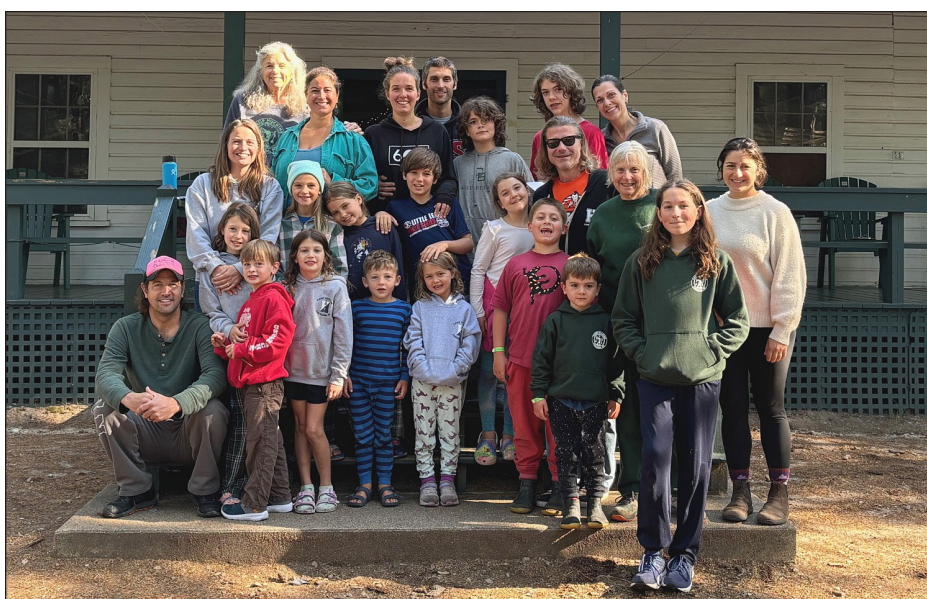
Family Camp Leadership