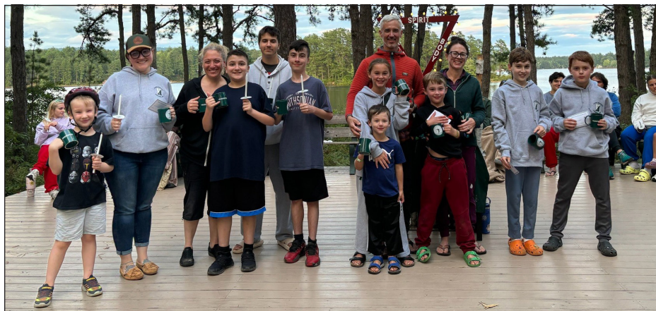
Family Camp Hucksters