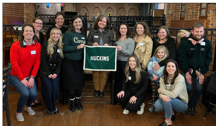
Washington, DC reunion