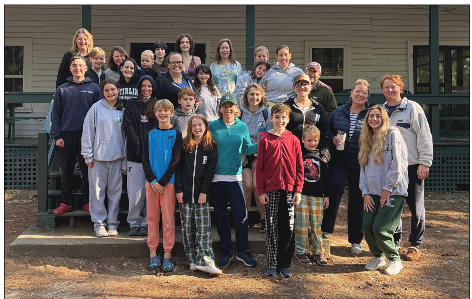
Family Camp Middlers