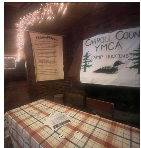
Community Benefit Night at Flatbread Co.