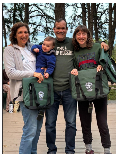
Family Camp 30-Year Hucksters