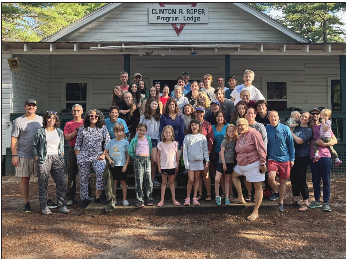
Labor Day Family Camp Seniors