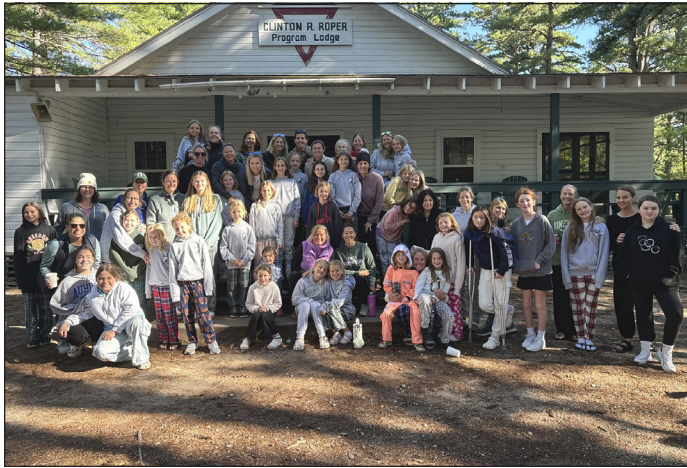
Mother/Daughter Weekend Juniors

Lasting memories were made at Mother/Daughter weekend 2024. We look forward to seeing you all in 2025 on September 5-7!