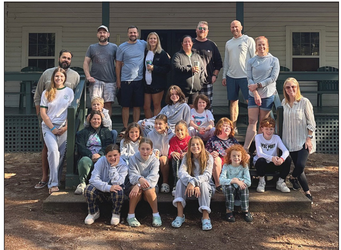
Labor Day Family Camp Leadership