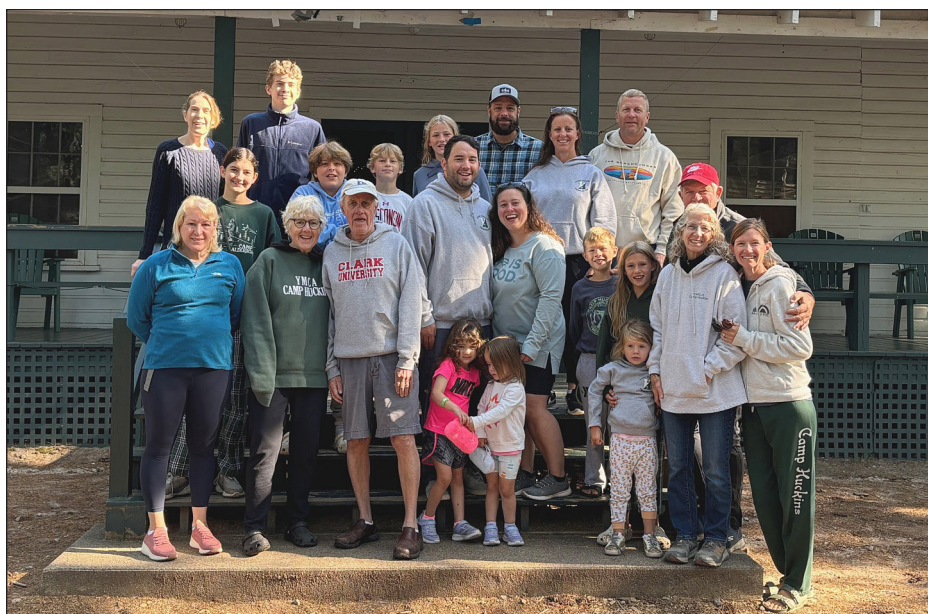
Family Camp Seniors