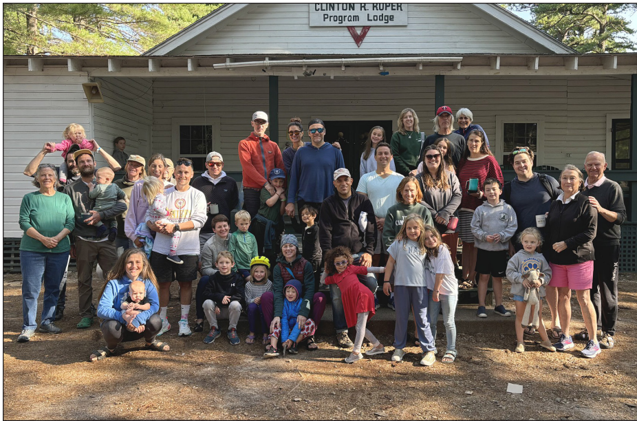
Family Camp Juniors

Huckins Family Camp Week and Labor Day Family Camps create unique, intergenerational Huckins experiences. Campers of all ages build their day around department specials and their favorite camp activity, earning their “sharpshooter” in archery one day and an island swim the next. In 2024 we welcomed new families and celebrated those that have been campers for decades!