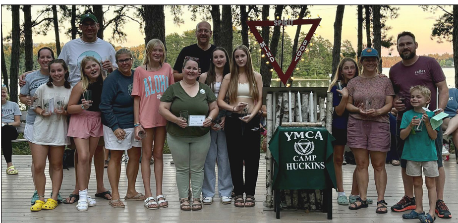
Labor Day Family Camp Hucksters