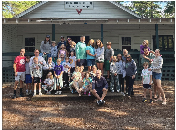
Labor Day Family Camp Middlers