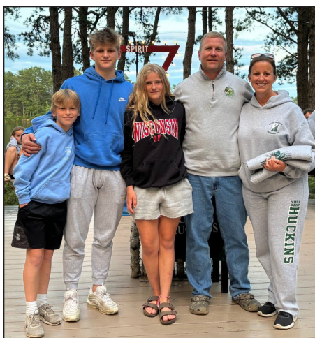
Family Camp 20-Year Hucksters